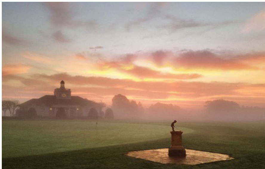
The Titleist Shop at the Padgett Center